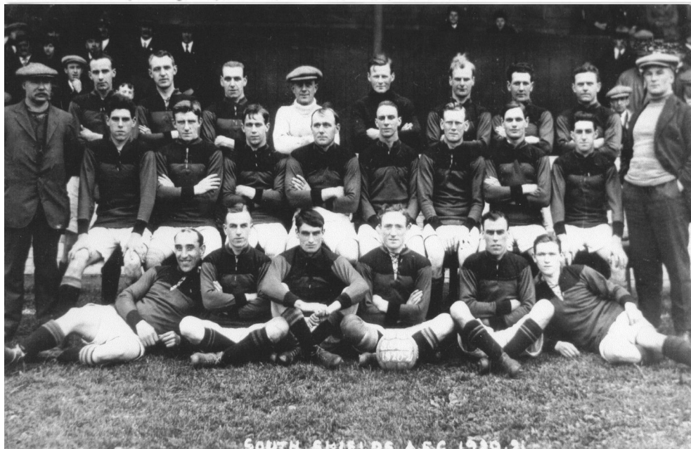
SOUTH SHIELDS A.F.C. 1920 ~ 1921